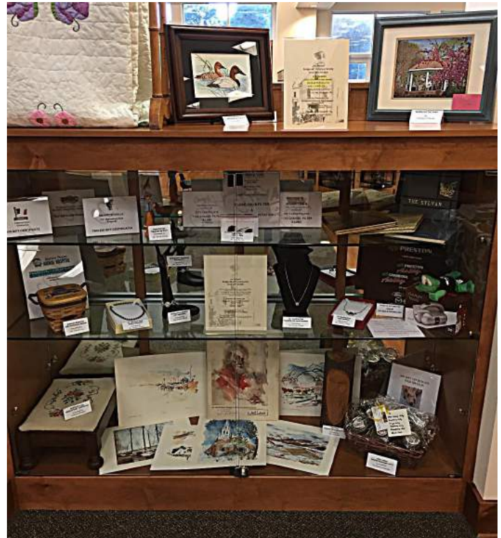
Items on display at the Bridgeville Public Library